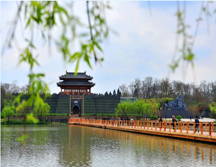
Song Folder City Heritage Park of Yangzhou