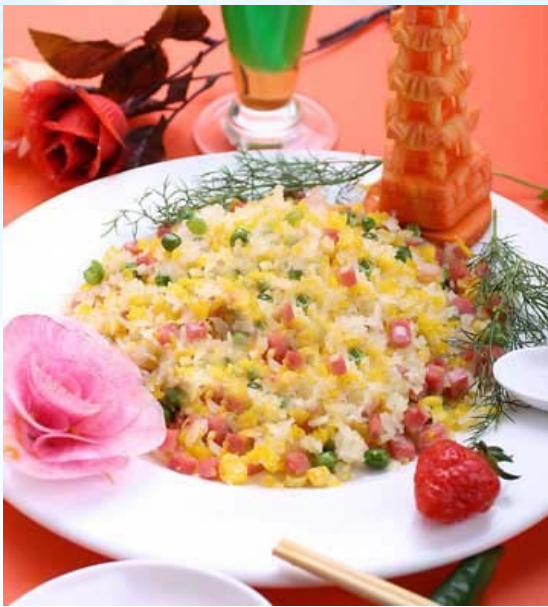
Yangzhou Fried Rice

Delicious Huaiyang food, one of the four major schools of the Chinese cuisine