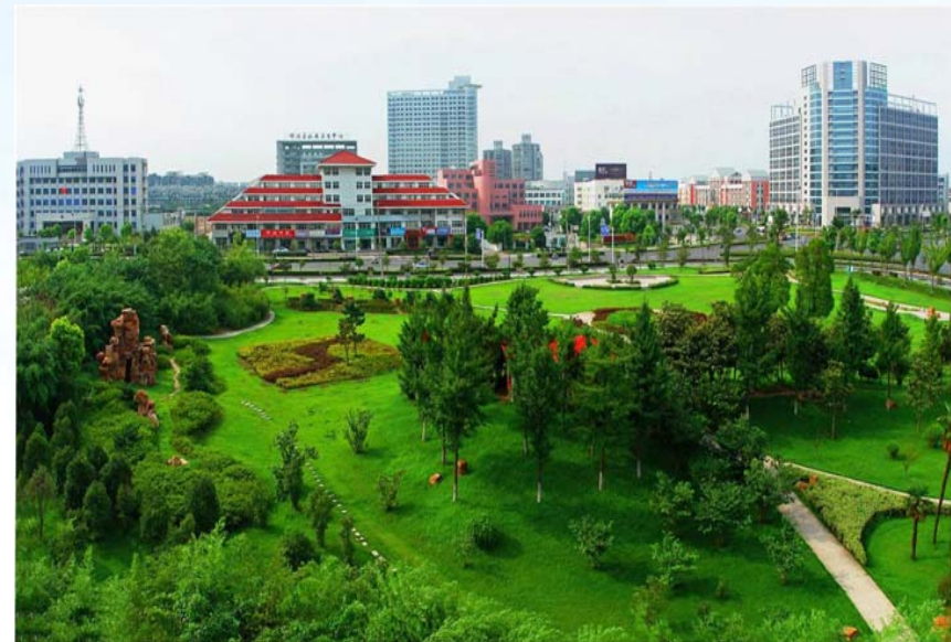
Urban Green Areas