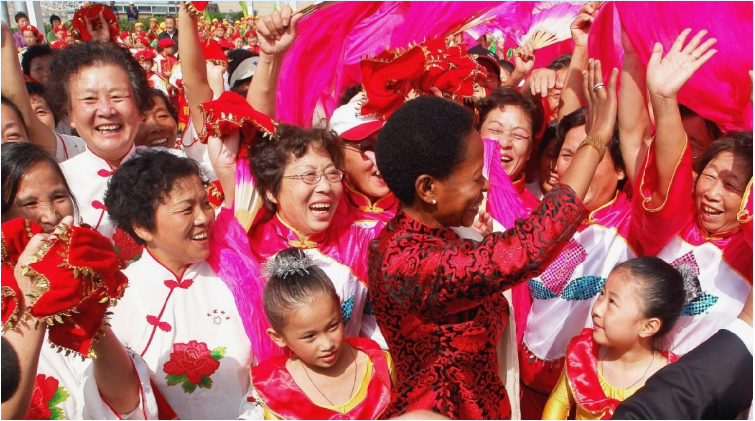
Former UN Under-Secretary-General Ms. Anna Tibaijuka: Yangzhou is a city full of smiling faces.