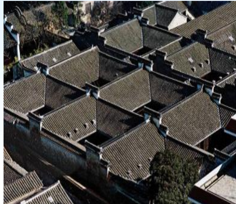
Old City of Yangzhou