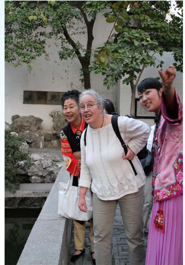
Visit Yangzhou in Flowery Spring