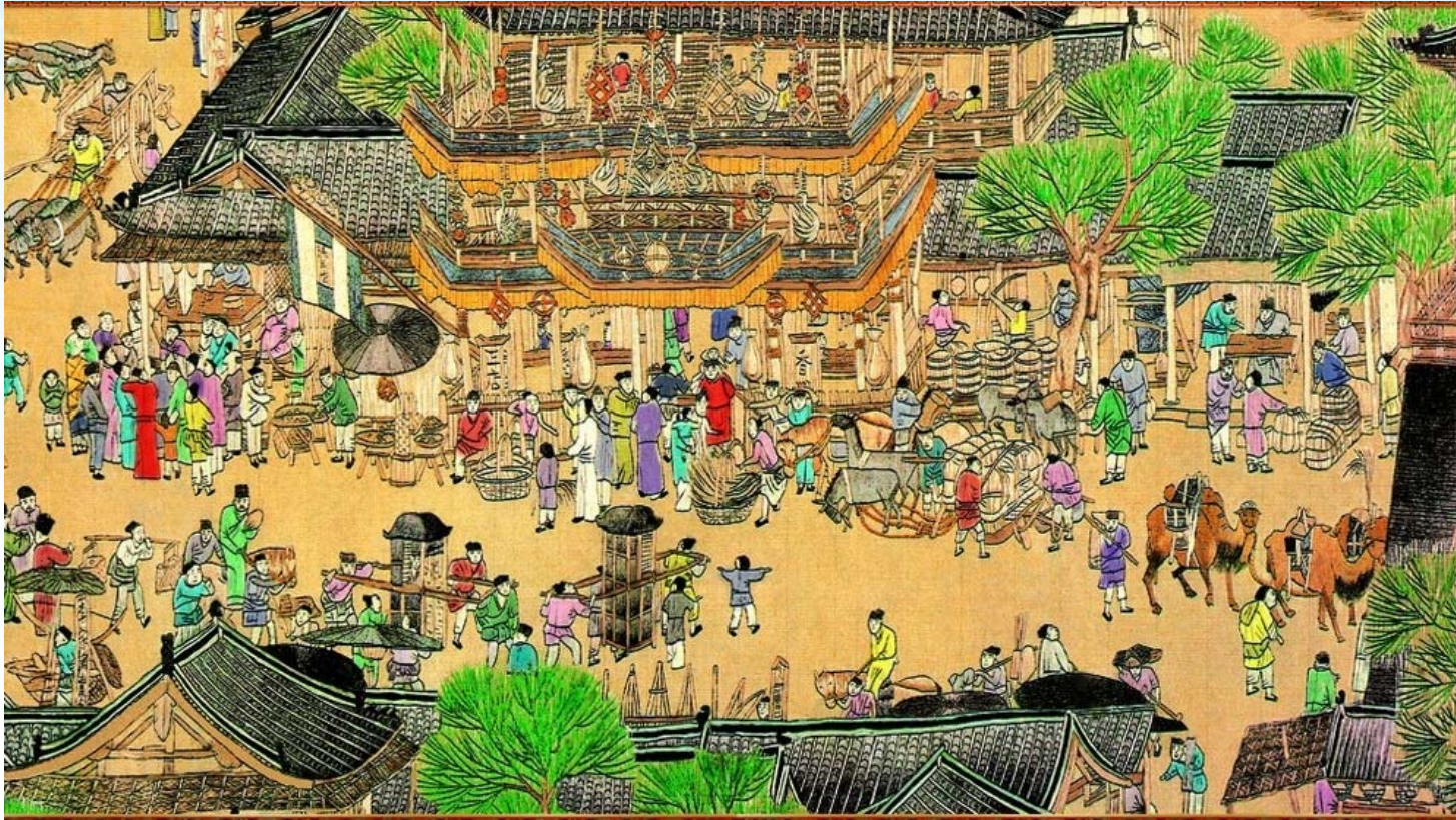
Flourishing Scene of Yangzhou in Tang Dynasty