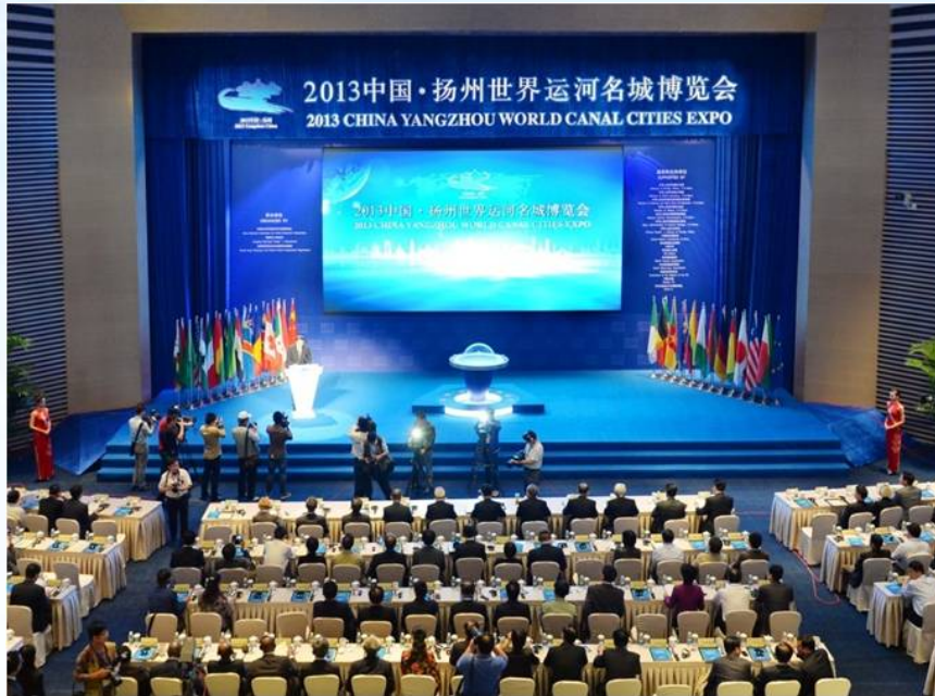
World Canal Cities Expo