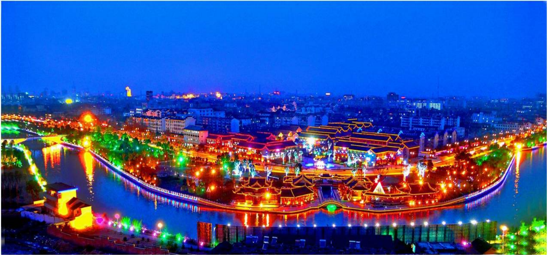
Night View of Yangzhou Ancient Canal