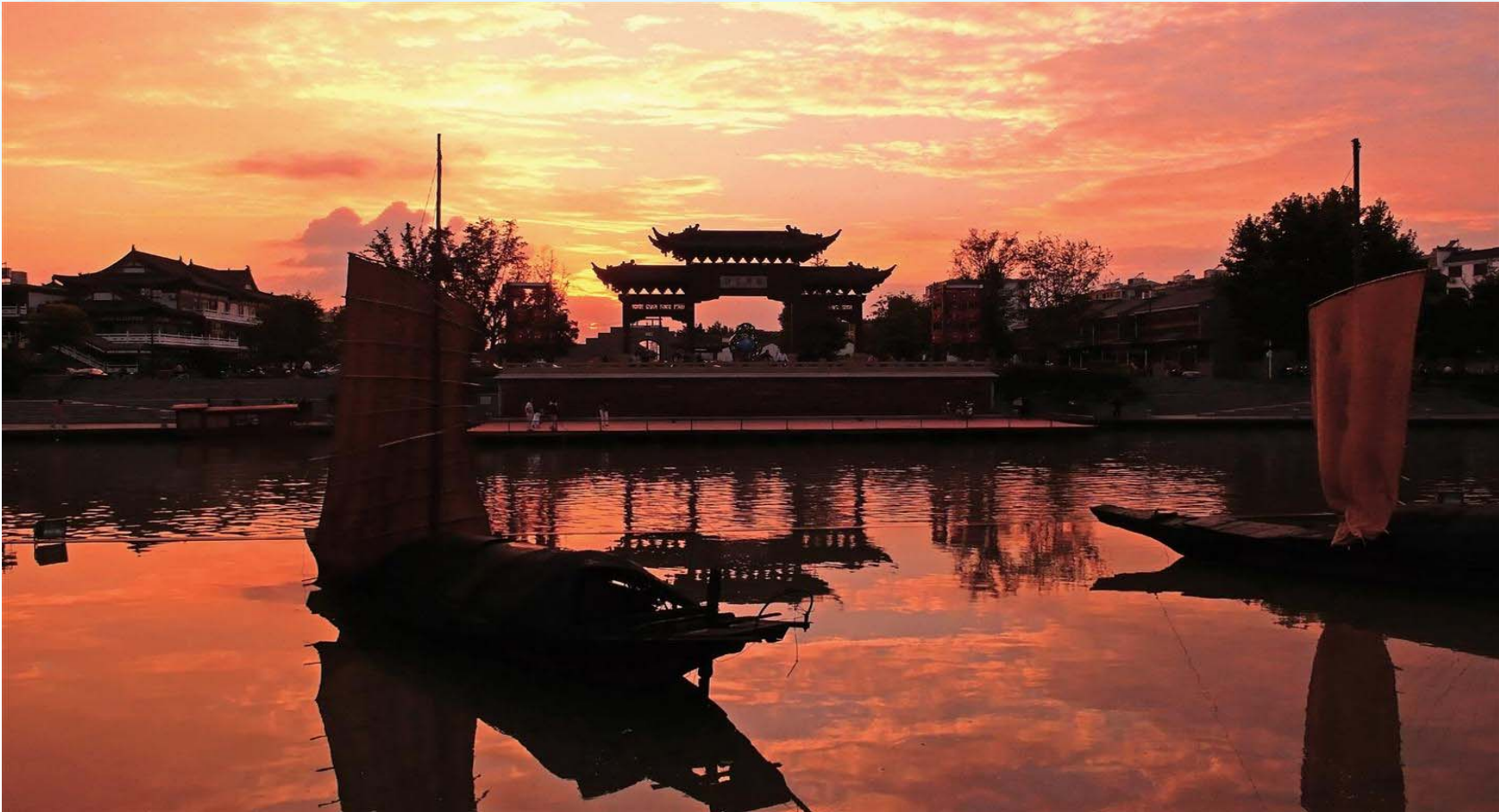
Dongguan Ancient Ferry on Canal