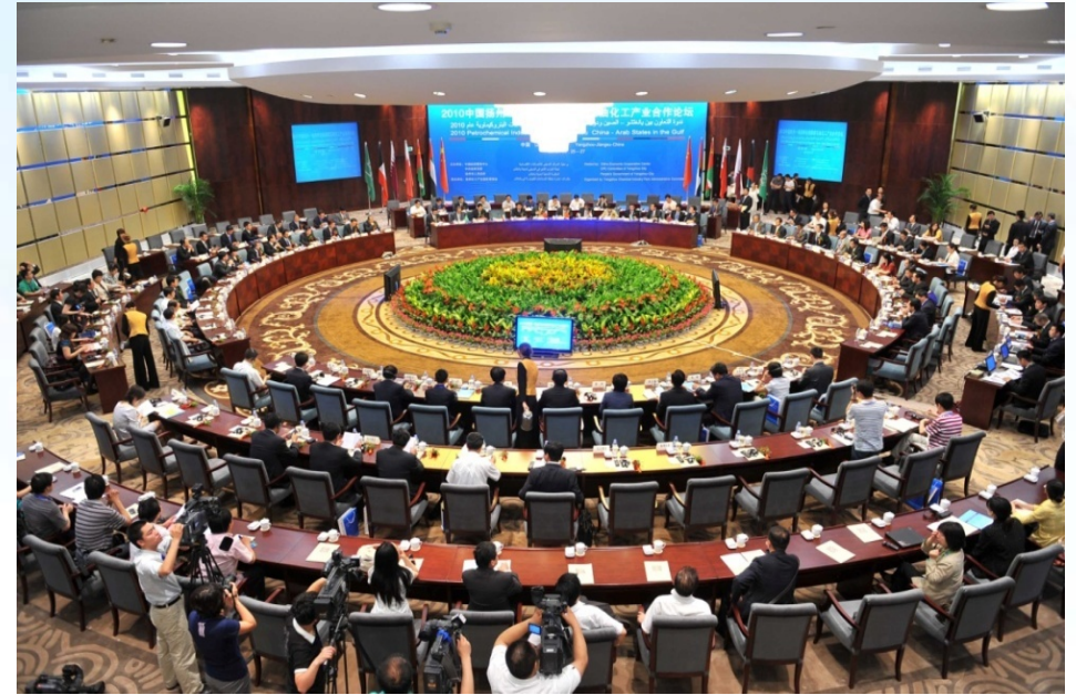
2010 Petrochemical Industry Forum