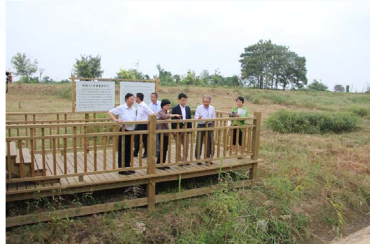
Evaluation on canal heritage sites in Yangzhou by UNESCO experts